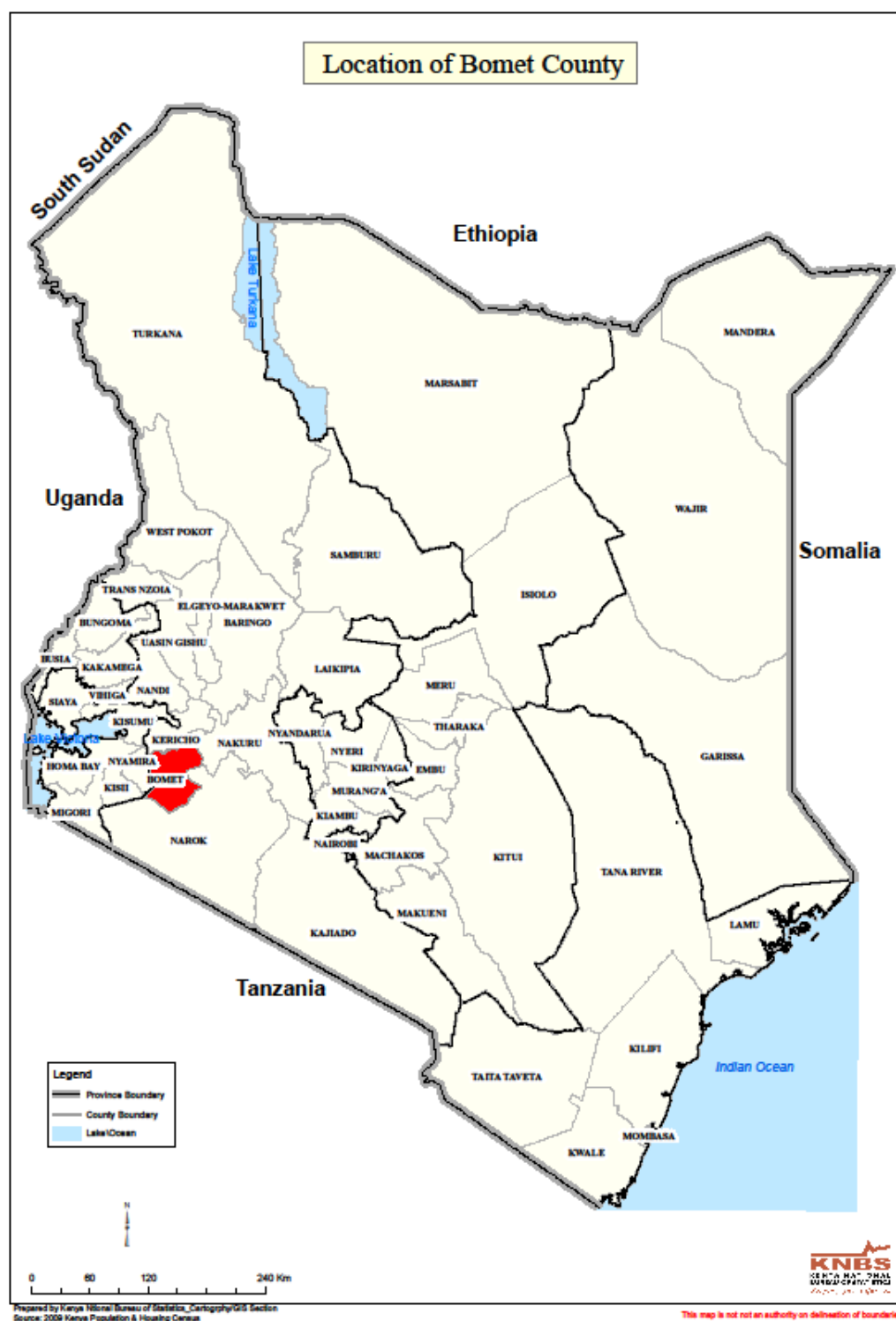
Figure 1: Map of Kenya Showing Location of Bomet County