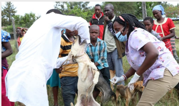
Launch of Countywide Vaccination of dogs campaign that targets over 10,000 dogs to mark the World Rabies Day on September 28, 2020.