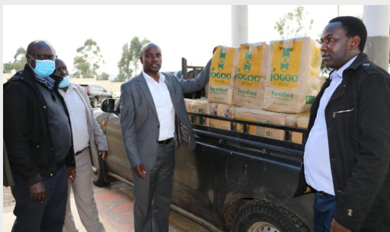
Governor Dr Hillary Barchok receives 80 bales of maize flour from Ndarawetta Tea Factory for distribution to vulnerable households affected economically by Covid 19 in the county.