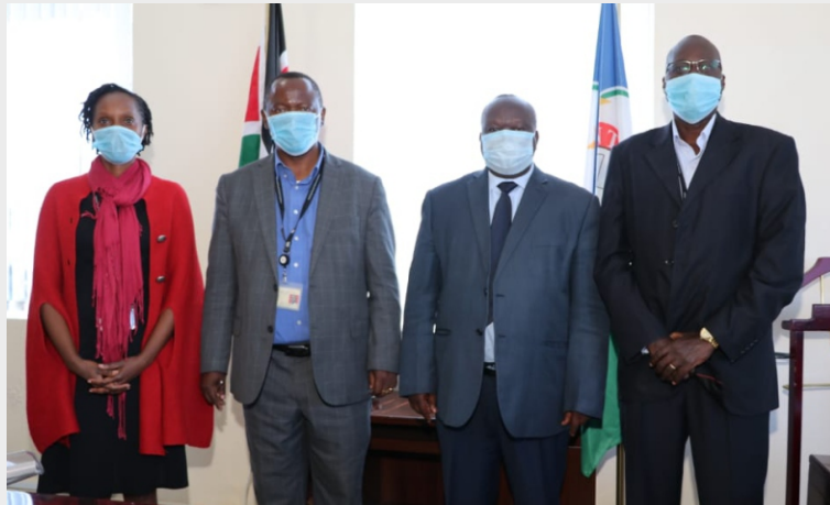
Bomet Deputy Governor Hon Shadrack Rotich with Bill and Melinda Gates Foundation delegation. The Foundation carried out two-day workshop to support 25 trainees for capacity building and skills development on planning/reproductive health services implementation in Bomet County.