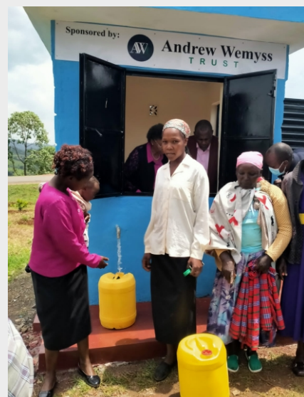
Kapkoros Chemogoi community borehole water project, serving 200 households, is now operational thanks to the cordial partnership between the County Government of Bomet and Sotik Tea through Andrew Wemyss Trust.