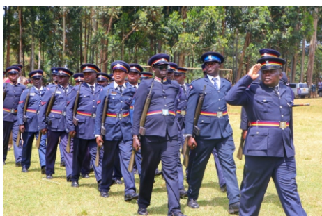
Kenya police officers.