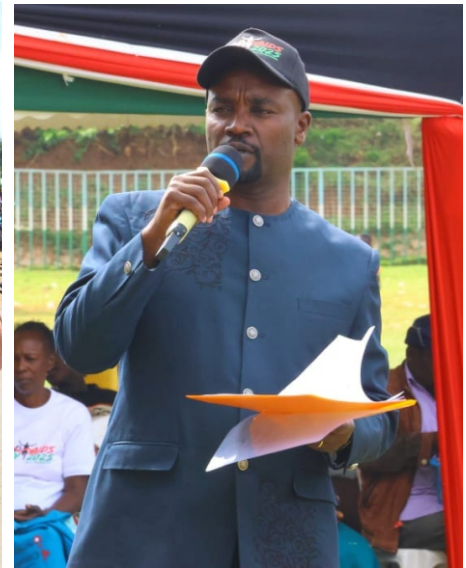
Governor Barchok, Bomet county.