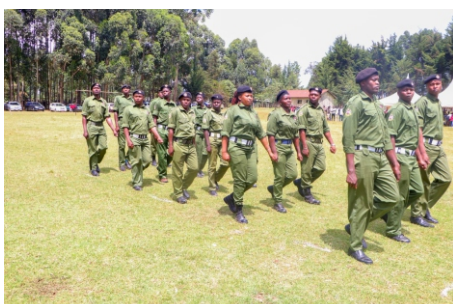
County reinforcement officers.