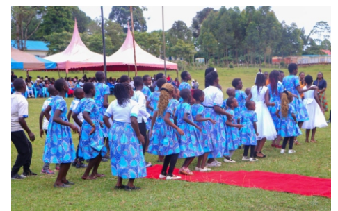
Choir of Boito ward.